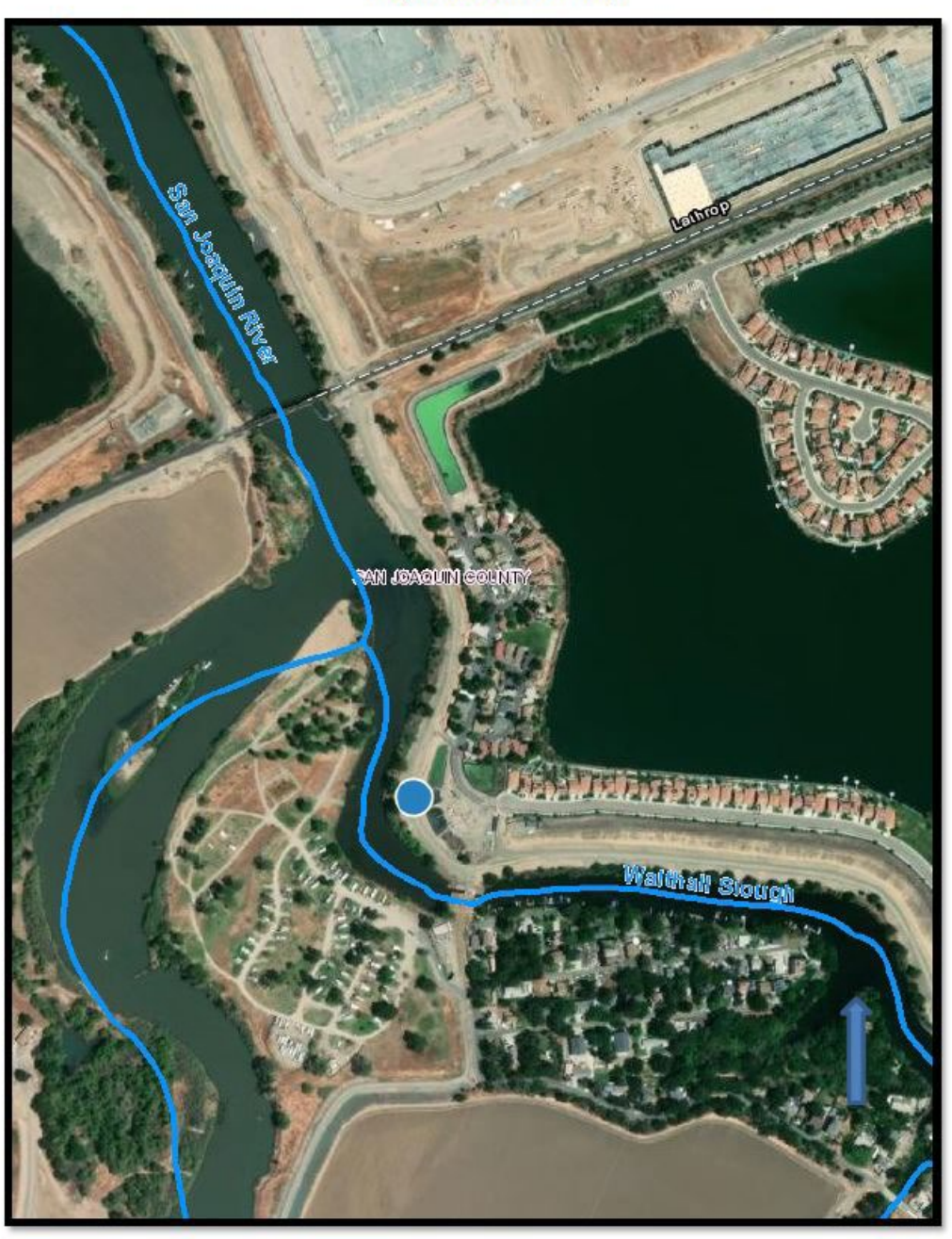
Project Location Map